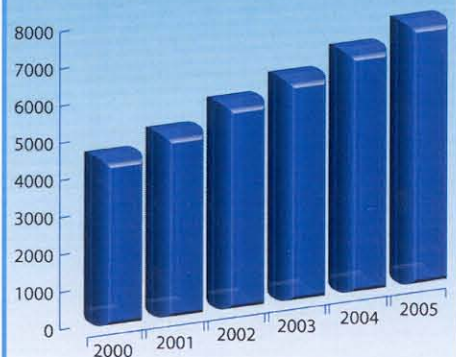
Progression of Stick Packaging (Based upon Japan & Europe)